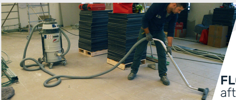
FLOOR CLEANING after work