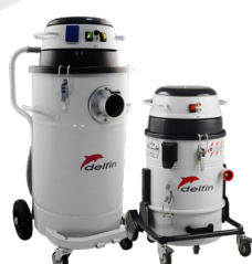
Application with CORE DRILLING MACHINE