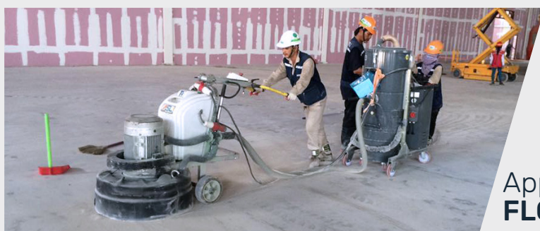
Application with FLOOR SANDER