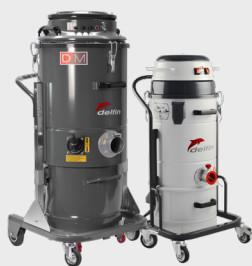
Application with FLOOR SCARIFIER