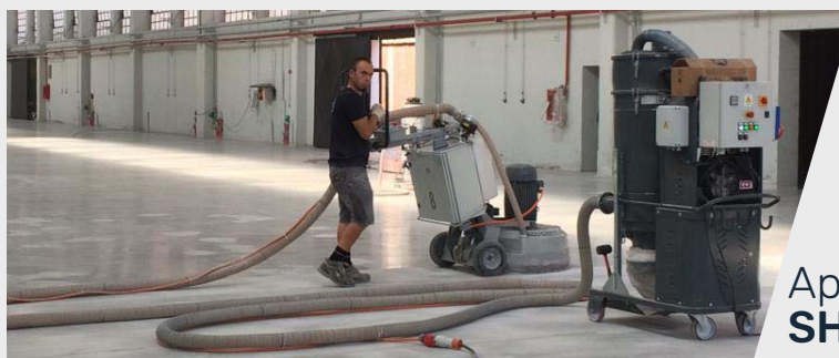
Application with SHOT BLASTER