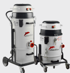
Application with MANUAL TOOL